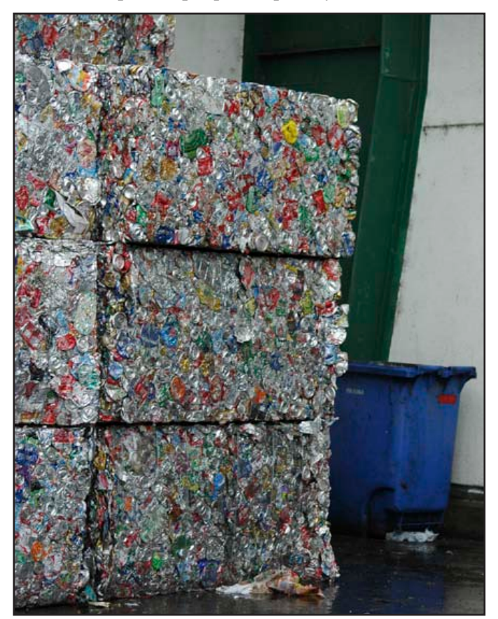
Many different kinds of materials can be recycled

amount of waste each person generates continue to increase. Municipal solid waste (MSW) includes items that are normally thrown in the trash, such as food packaging or scraps, old furniture, tires, or yard clippings. According to a study by the Environmental Protection Agency (EPA), municipal solid waste generation increased from 2.68 to 4.34 pounds per person per day between 1960