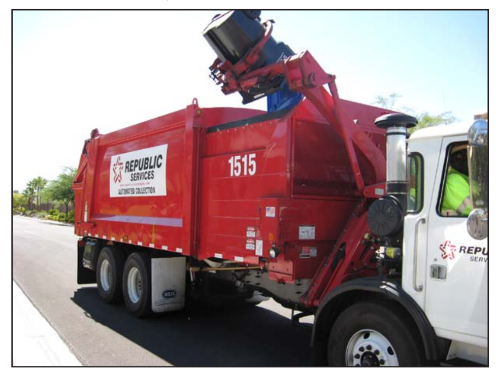
Drivers may use trucks with hydraulic lifting mechanisms

Recycling companies or local governments offering home pickup services employ drivers, also called recyclable material collectors, to pick up and transport recyclables to an MRF.