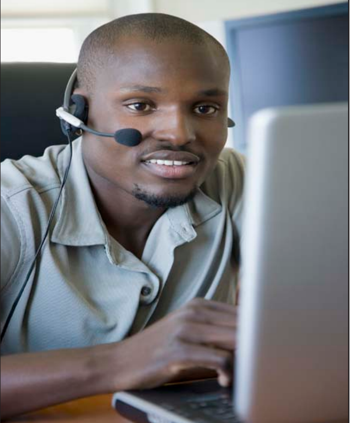
Sales representatives might sell collection services or sorted recyclables

BLS does not have data specifically for sales representatives working in recycling. However, these workers are included in the occupations sales representatives, services, all other; and sales representatives, wholesale manufacturing, except technical and scientific products. Table 2 shows wages for these occupations in the remediation and other waste services industry group. The wage is the