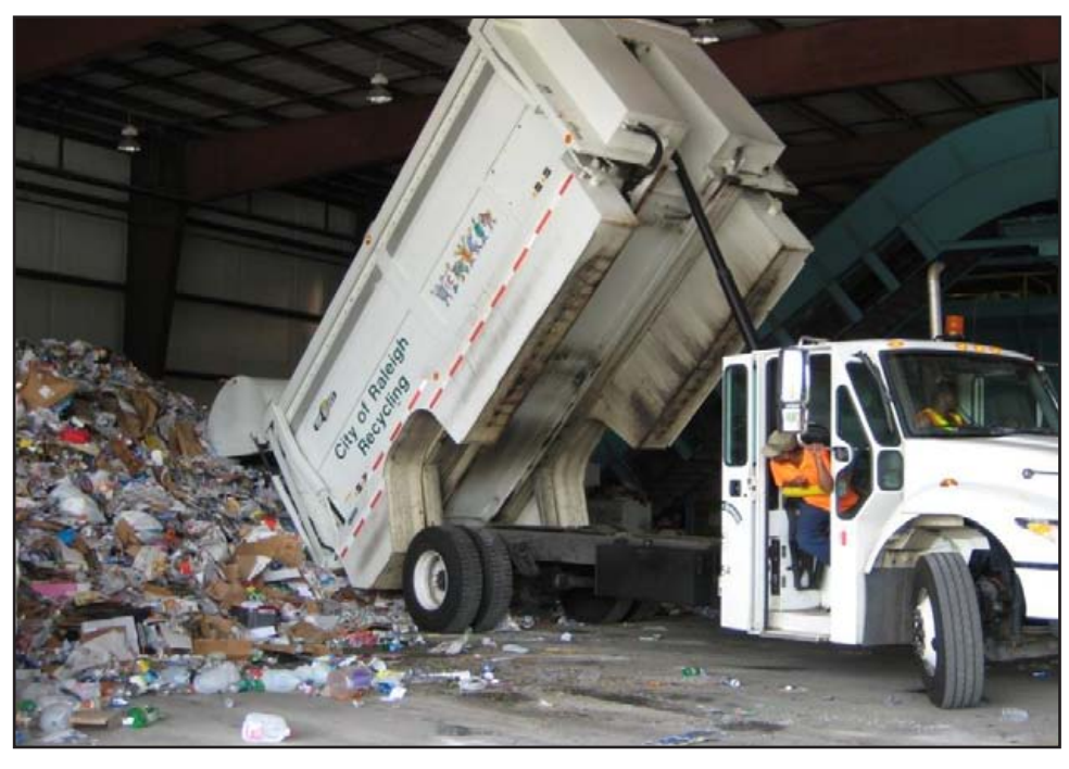
Well-maintained recycling trucks are critical for an MRF's operations

BLS does not have data specific to mechanics, technicians, and machinery maintenance workers at MRFs. However, these workers are included in the occupations industrial mechanics; maintenance workers, machinery; and bus and truck mechanics and diesel engine specialists. Table 1 shows wages for these occupations in the remediation and other waste management services industry group. The