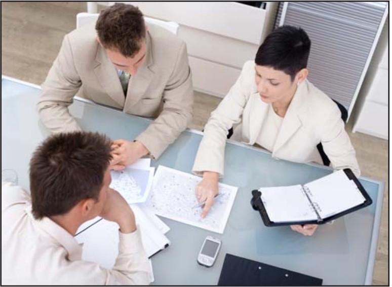
Route managers choose the most efficient schedules for recyclable collection

Using maps and customer data, route managers choose the best schedule and routes for collecting recyclables from customers. They determine the most efficient routes and assign them to drivers. Route managers monitor drivers' routes and might solicit their feedback before making changes. They record statistics, including the length of each route, the time it takes to run each route, number of homes serviced, and the amount of